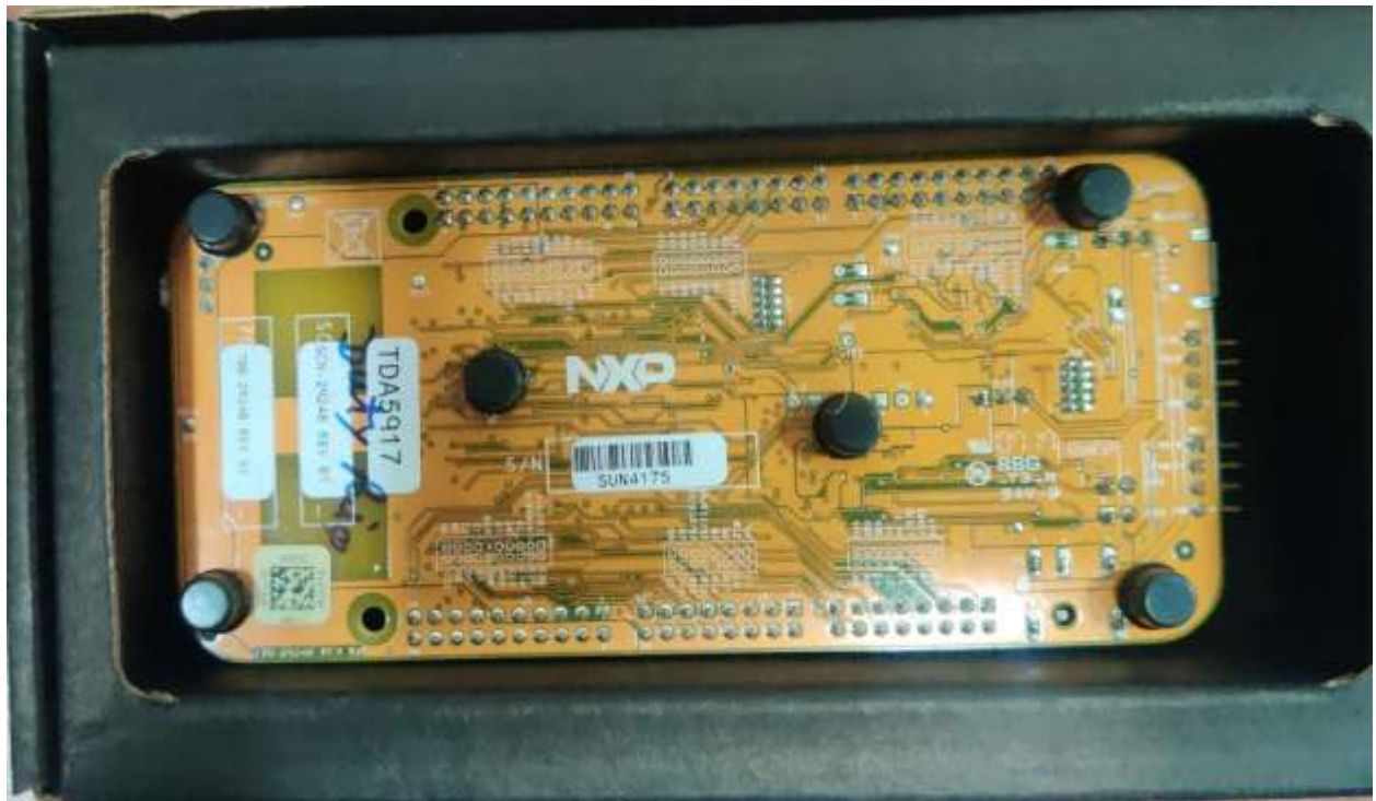
5. RF transceiver module