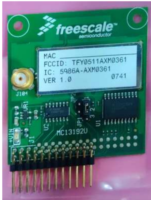
6. Student learning kit